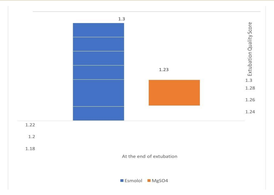
Figure 1: Extubation Quality Score at the end of extubation