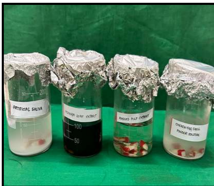
Figure 1: Specimens from each group were immersed in their respective remineralisation solution for 14 days

The teeth in each group were immersed in their respective remineralisation solution for 14 days. Half of the samples from each group were subjected to Scanning electron microscopic and Energy dispersive X-ray analysis for surface morphology and elemental composition respectively. And the other half samples were assessed for microhardness using Vickers micro hardness test.